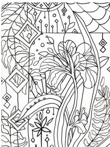
Iris Looking Through Glass