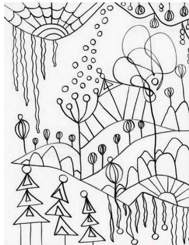
Which Way is Up