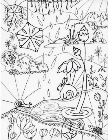
Rabbit and Raindrops