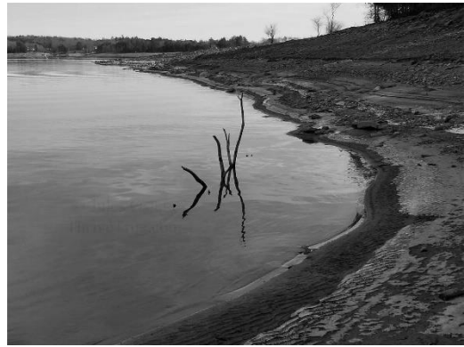
Styx and Stones

(other locations, angles, orientations, close-ups, color and similar photos available)