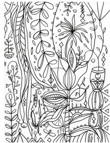
Plant Pow Wow