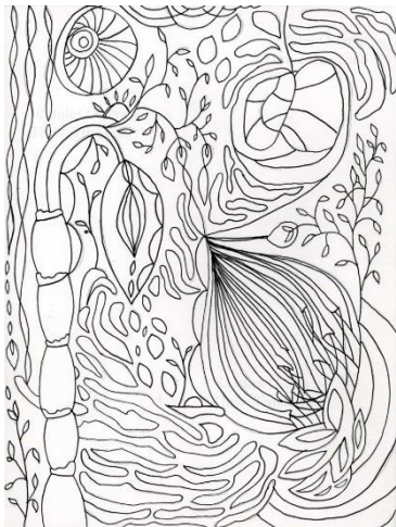
With the Current