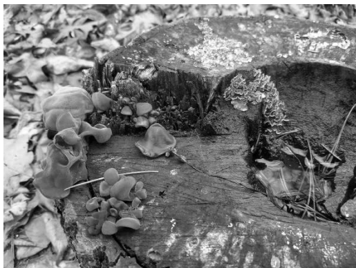
Fungi at the Pool