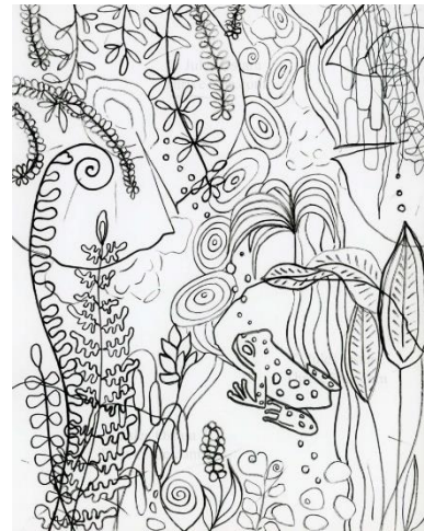
Welcome to My Pad