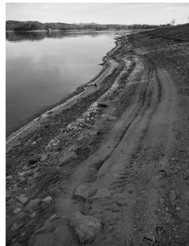
Frosty Shore Lines