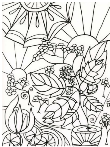
Mint Lily Pads