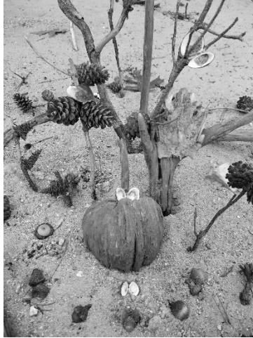
Winter Bones Nature Mandala