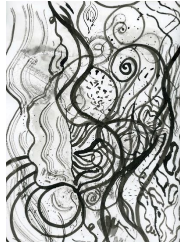
Fungi and Flora